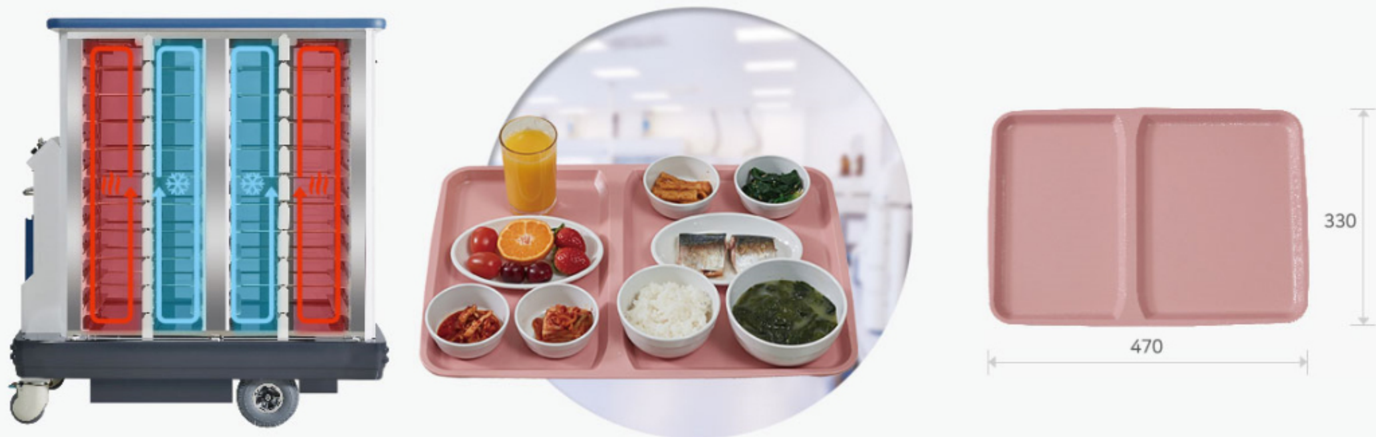
Hot-Cold-Type Basic (Electric)