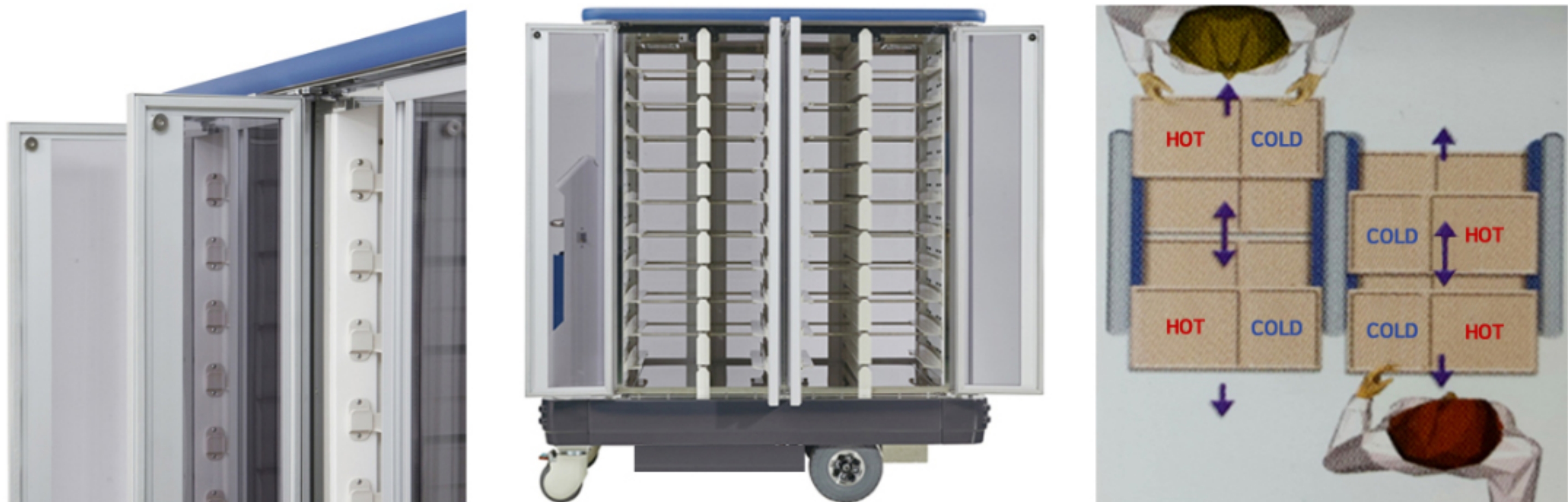
< Double-Door Pass Type >